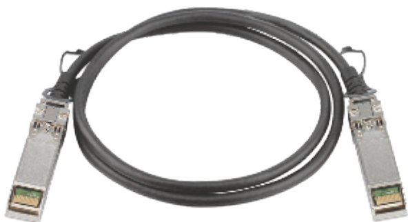
Figure 1. DAC Cable

AECs are relatively new and aim to match the transmission rates of AOC cables (at shorter distances), but more economically. AECs are narrow gauge copper cables with industry standard connectors at each end. Its active cables are mainly used for the connection of top of rack servers, distributed chassis, and up to 500 cables per rack. AEC active cable supports transmission rates of 100G, 200G, 400G, optics types include OSFP56, OSFP, OSFP-DD.