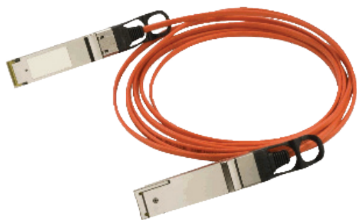
Figure 3. AOC Cable

Active Optical Cables (AOC) as shown in Figure 3 and Figure 4 are used in point-to-point and break-out interconnect applications in data centers, most often within the same rack or row. AOC cables were designed to fix capacity and reach problems in the world's data centers. Traditional copper cabling used in data centers was heavy, making moves, adds, and changes very difficult. In addition, EMI given off by data center equipment hampered transmission performance on the copper cables, often significantly. AOCs are naturally immune to EMI, and are also lighter, thinner, and have a longer range than the DAC and AEC. For example, an AOC cable can transmit at 400Gbps for 100 m compared to only 2 m for DAC and 7m for AEC. The AOC is actually an active assembly which explains its greater range and higher cost, and is comprised of transceivers, control chips, modules fused to either end, and the fiber optics cable. When selecting cables, the length, data rate, and transceiver type must be chosen with some certainty because they cannot be changed once the AOC is manufactured. Figure 4 shows an example of breakout cable (DACs and AECs also have breakout options) such as 4x10GE, 4x25GE, or potentially 4x100GE.