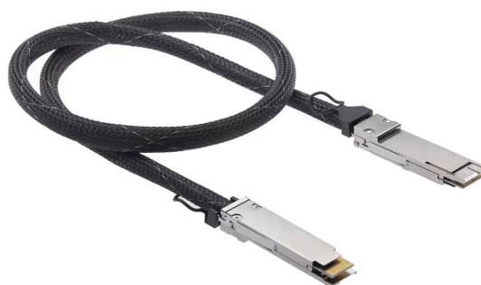
Figure 2. AEC Cable